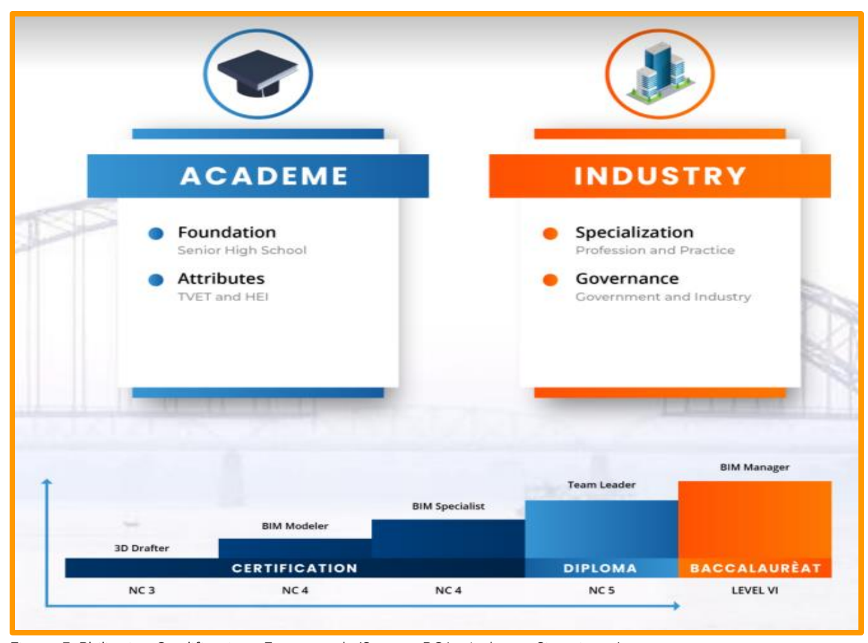
Figure 3. Philippine Qualifications Framework (Source: PCA - Industry Situationer).